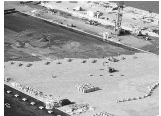
Figure 7. Maintaining an angular laying face that resembles a saw-tooth pattern facilitates installation of paver clusters.

Joint sand should be spread on the surface of the pavers in a dry state.