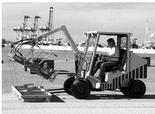
Figure 11. Sweeping jointing sand across the pavers is done after the initial compaction of the concrete pavers.

After the final compaction of the joints in the sand, filling and consolidation of the joint sand should be checked by visually inspecting them. Consolidation is important to achieving interlock among the units. Consolidation also reduces infiltration of water into the sand and base. This can be done by dividing the project into areas of about 5,000 sf to 10,000 sf (500