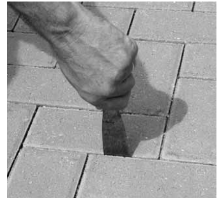
Figure 13. A simple test with a putty knife checks consolidation of the joint sand.

close coordination of vehicular traffic with other contractors working in the area. After the paver installation subcontractor moves to another area of a large site, or completes the job and leaves, he has no control over protection of the pavement. Therefore the GC should assume responsibility for protecting the completed work from damage, fuel or chemical spills. If there is damage, it should be repaired to its original condition, or as directed by the Engineer. When the job is completed, all equipment, debris and other materials are removed from the pavement.