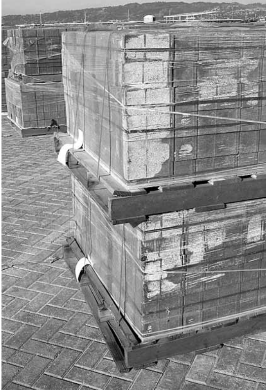
Figure 2. Bundles of ready-to-install pavers for setting by mechanical equipment. Bundles are often called cubes of pavers.

Base: Layer(s) of material under the wearing course and bedding course.