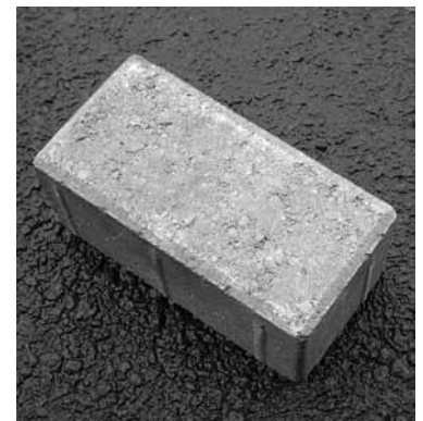
Figure 4. Spacer bars are small nibs on the sides of the pavers that provide a minimum joint spacing into which joint sand can enter.

A key aspect of this guide specification is dimensional tolerances of concrete pavers. For length and width tolerances, ASTM C 936 allows ±1/16 in. (±1.6 mm) and CSA A231.2 allows ±2 mm. These