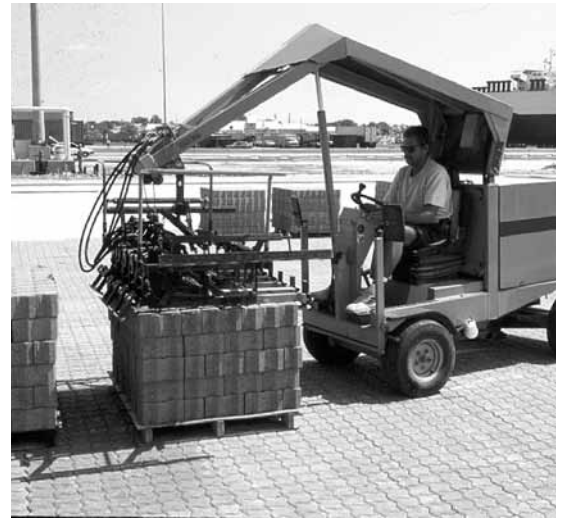
Figure 3. A cluster of pavers (or layer) is grabbed for placement by mechanical installation equipment. The pavers within the cluster are arranged in the final laying pattern as shown under the equipment.

A large variation in cluster size can reduce mechanized paving productivity, thereby increasing costs and lengthening production schedules. Extreme variations in cluster size can make mechanical installation impossible. Following certain procedures during manufacture will reduce the risk of areas of cluster sizes that will not fit easily against already placed clusters. Such procedures include (1) consistent monitoring of mold cavity dimensions and mold rotation during manufacture, (2) consistent filling of the mold cavities, (3) using a water/cement ratio that does not cause the units to slump or produce "bellies" on their sides after the pavers are released from the mold, and (4) moderating the speed of production equipment such that pavers