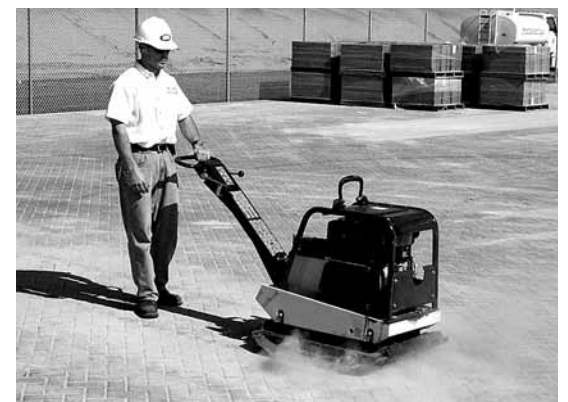
Figure 12. Final compaction should consolidate the sand in the joints of the concrete pavers.