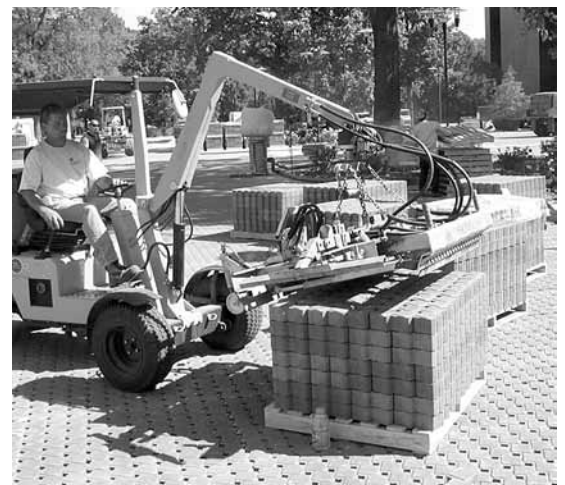
Figure 1. Mechanical installation of interlocking concrete pavements (left) and permeable units (right) is seeing increased use in industrial, port, and commercial paving projects to increase efficiency and safety.