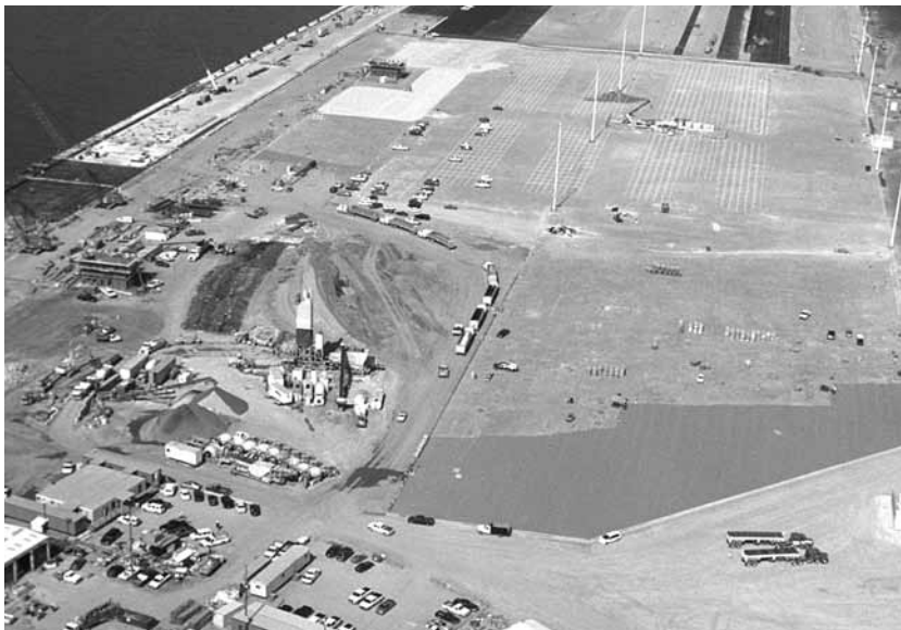
Figure 14. The Port of Oakland, California, is the largest mechanically installed project in the western hemisphere at 4.7 million sf (470,000 m 2 ).

Warning: The content of ICPI Tech Spec technical bulletins is intended for use only as a guideline. It is NOT intended for use or reliance upon as an industry standard, certification or specification. ICPI makes no promises, representations or warranties of any kind, express or implied, as to the content of the Tech Spec Technical Bulletins and disclaims any liability for damages resulting from the use of Tech Spec Technical Bulletins. Professional assistance should be sought with respect to the design, specifications and construction of each project.