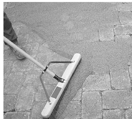
Figure 5. Joint sand can be pre-mixed and delivered to the site (typically in bags), or mixed with stabilizer at the site, then swept into the joints, compacted for consolidation in them to create interlock, and wetted to activate the stabilizer.

There are some applications where early stabilization of the joints is important to maintaining functional performance of the paver surface. For example, stabilization is recommended on high slope applications over 7% and on applications where the slope is less than 1.5%. Applications on high slopes will help prevent wash-out of joint sand. Stabilizers in very low slope or flat areas can help reduce infiltration of standing water.