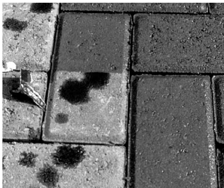
Figure 9. Sealers resist stains which makes them ideal for high use areas where they might occur.