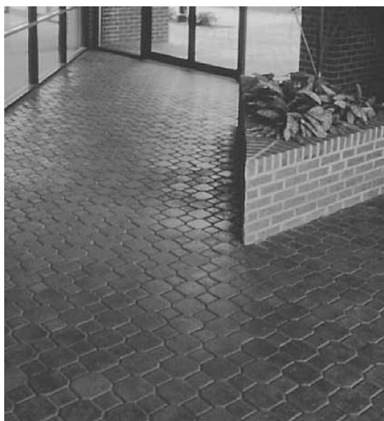
Figure 1. Many sealers enhance the appearance of concrete pavers and protect against staining.

Stains on specific areas should be removed first. A cleaner should be used next to remove any efflorescence and dirt from the entire pavement. A newly cleaned pavement can be an opportune time to apply joint sand stabilizers or seal it. In order to achieve maximum results, use stain removers, cleaners, joint sand stabilizers, and sealers specifically for concrete pavers. These may be purchased from a manufacturer, contractor, dealer or associate member of the Interlocking Concrete Pavement Institute.