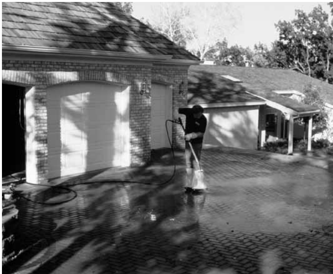
Figure 2. Pressurized cleaning equipment used by professional cleaning and sealing companies can bring out the best appearance from pavers.

If there is a need to remove deposits before they wear away, best results can be obtained by using a proprietary efflorescence remover. The acid in proprietary cleaning chemicals is buffered and blended with other chemicals to provide effective cleaning without damage to the paver surface. Always refer to the paver supplier or chemical company supplying the chemicals for recommendations on proper dilution and application of chemicals for removal of efflorescence. They are generally applied in sections beginning at the top of slope of the pavement. If the area