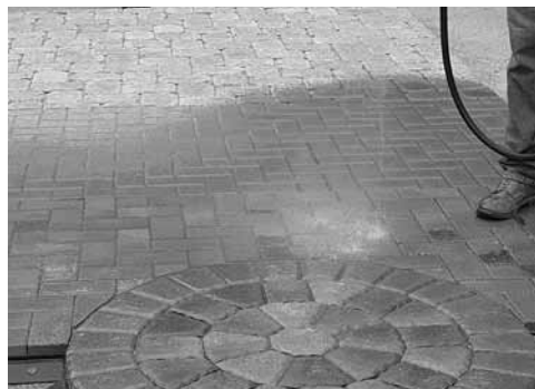
Figure 7. Dry-applied joint sand with a stabilizer is wetted in order to activate it and stiffen the sand. Once the joints dry, they are stabilized.