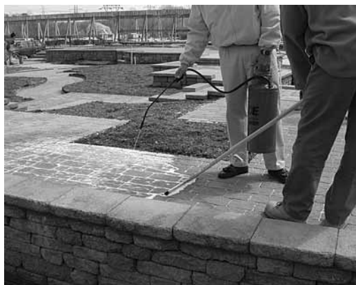
Figure 3. This liquid joint sand stabilizer is applied with a low-pressure sprayer and squeegeed across the surface after allowing some time for soaking into the joints. This helps maintain slip and skid resistance of the paver surface.