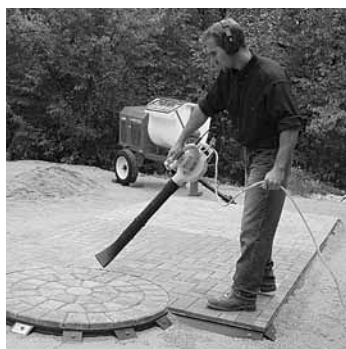
Figure 6. Whether using liquid or dry joint stabilization materials, the surface of the pavers should be cleaned with a blower or broom after the joint sand is compacted into the joints.

Joint sand gradation can affect the depth of penetration of the liquid stabilizer. The amount of fines or material passing the No. 200 (0.075 mm sieve) can influence the depth of penetration. A joint sand gradation with less than 5% passing the No. 200 (0.075 mm) sieve can allow better penetration of liquid stabilizers. A job site mock-up