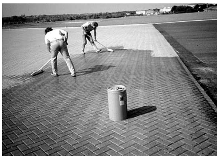
Figure 10. Urethane is applied with squeegees to stabilize joint sand between pavers on aircraft pavement.

Cover and protect all surfaces and vegetation around the area to be sealed. For exterior (low-pressure) sprayed applications, the wind should be calm so that it does not cause an uneven application, or blow the sealer onto other surfaces. For many sealers, especially those with high VOC's, wear protective clothing and mask recommended by the sealer manufacturer to protect the lungs and eyes.