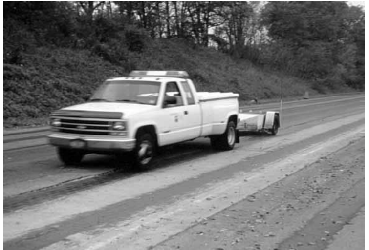
Figure 4. ASTM E 274 Test Equipment consists of a truck and trailer assembly. A tire within the trailer is towed a given speed, locked, and skidded across water dispensed on the pavement in front of it.

measure resistance while moving across a small portion of the pavement. They do not involve the use of a tire. Dynamic devices make measurements with a tire while moving at a constant velocity across the pavement surface. A common device used for static measurement is the portable British Pendulum Tester. See Figure 3. This test method is described in ASTM E 303, Standard Test Method for Measuring Surface Frictional Properties Using the British Pendulum Tester (7). This device is used for laboratory or on-site testing of skid resistance on surfaces. It consists of a small rubber shoe at the end of spring-loaded pendulum. The tester measures frictional resistance between the rubber shoe and the point of contact with the pavement. The contact area of the shoe against the test surface is about 3 in. 2 (19 cm 2 ), so measurements are influenced only by microtexture of the surface.