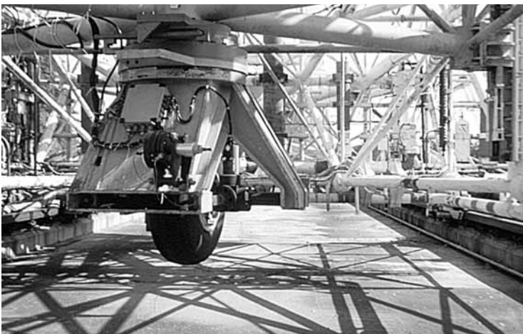
Figure 7. Test equipment for evaluation of the friction properties of concrete pavers at NASA's Aircraft Dynamics Landing Facility (ADLF) in Langley, Virginia