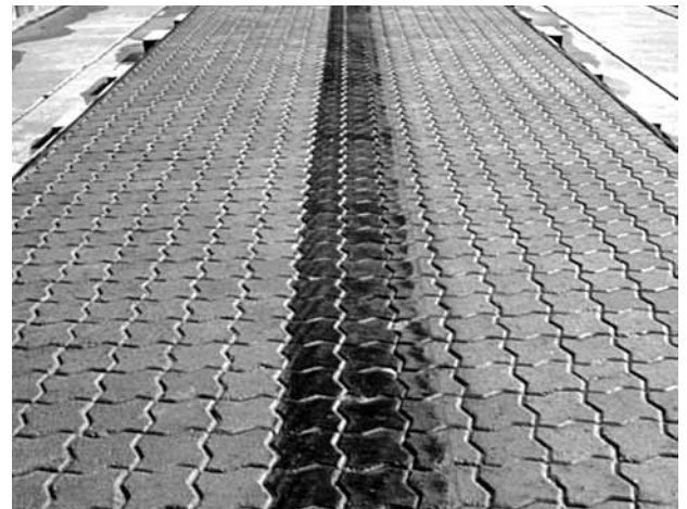
Figure 8. Test surface at the NASA ADLF facility