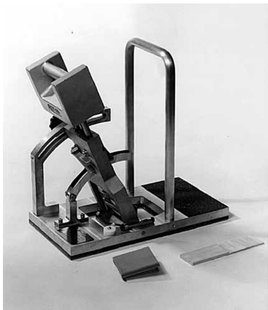
Figure 2. The NIST-Brungraber Mark II tester for slip resistance

rooms and spaces including floors, walks, ramps, stairs, and curb ramps shall be stable, firm, and slip resistant and shall comply with (Appendix) 4.5" (1). The Appendix includes recommendations for slip resistance expressed as a minimum coefficient of friction of 0.6 for accessible routes and 0.8 for ramps (dry surfaces) (2). These are advisory recommendations and are not standards. Design and testing standards may be required by the Occupational Safety and Health Administration (OSHA) for workplace safety, by other federal, state, provincial, or local regulations.